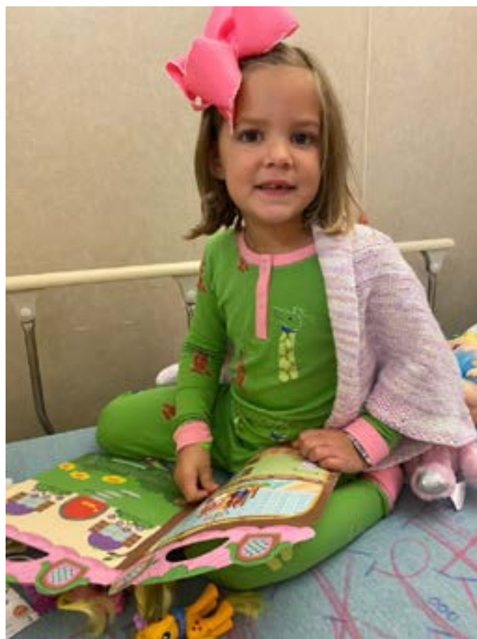
This sweetheart is among several parishioners who have received prayer shawls in recent months.