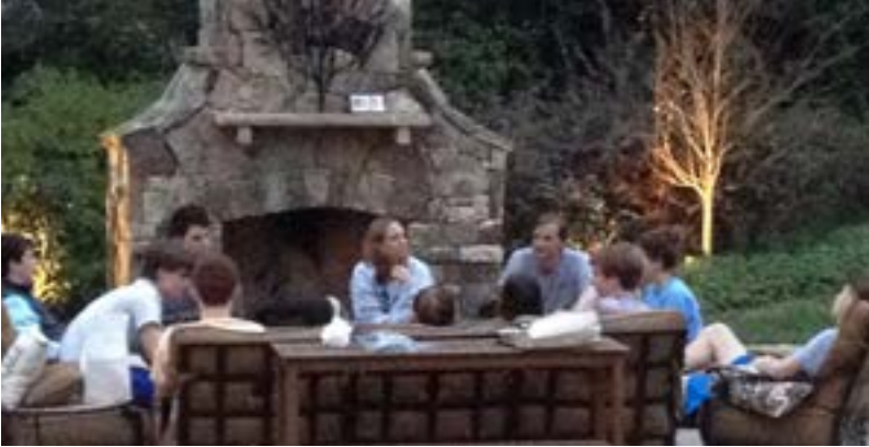
The Tenth Grade Life Group meets to plan and discuss their pilgrimage.