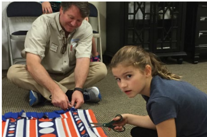
Photos above and below: JYC’ers hard at work and having fun during Seven Days of Serve-a-bration.