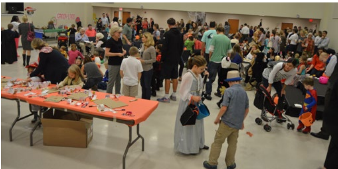
Trunk or Treat was a great evening of creativity, hospitality, and fun for everyone.

Despite the threat of thunderstorms amid days of rain, no spirits were dampened during our second annual Trunk or Treat event. Over 350 children and adults celebrated All Hallows Eve in All Saints' Hall, as they enjoyed a hot dog supper, decorated bags, visited the tattoo booth, and paraded and trick-or-treated among the fabulously decorated tables (in lieu of trunks). Christ Church youth families welcomed families from Charlotte Family Housing who joined us for the festivities. A grand time was had by all! For a slideshow of photos from this event, visit www.christchurch-charlotte.org/trunkortreat .