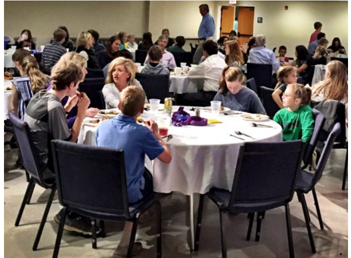
Faith Talks are a monthly opportunity for families of youth to gather for dinner and conversation about important topics.

Christ Church tenth graders are selling AutoBell tickets to raise funds for their pilgrimage to Canada this summer. Tickets are $15.99 for a full service car wash at any AutoBell location. They make great stocking stuffers! Find a pilgrim or stop by the GoodNews Shop.