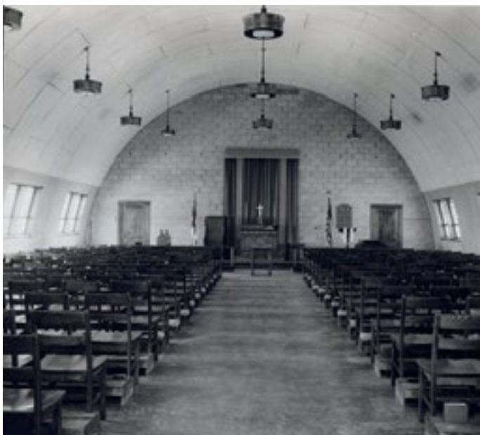
Inside of Quonset Hut, 1948.

Rector's Class, Sunday, April 15, 10:00 AM