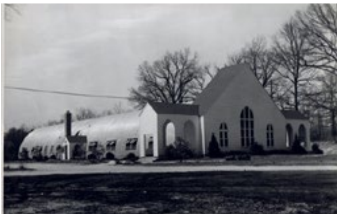
Christ Church Mission is established. Quonset Hut erected for worship services, 1944.

nity to determine their needs. Meetings have also been held with clergy and staff at Christ Church to learn about what they are working on and what their hopes and dreams for the future might be. We plan to bring the congregation into the conversation over the next several months. The committee’s goal is to establish a list of priorities for the next five years that will continue to make Christ Church vital and relevant in the lives of our parishioners and in the life of our community. Initiatives will flow from these priorities which will equip and empower parishioners to engage in our existing mission to Love God, Care for Each Other, and Serve the World.