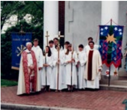
50th Anniversary celebration, 1993.

My stepfather used to enjoy quoting Plutarch, who said, “It is certainly desirable to be well descended, but the glory belongs to our ancestors.” While it is important to remember and honor those who lit the path that we still follow today – we must continue to shine our light forward by discerning God’s will and planning for the future of our Spiritual Home.