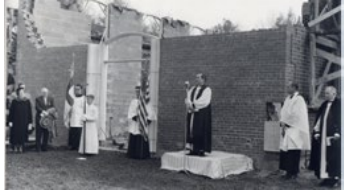
Laying the cornerstone, 1951.