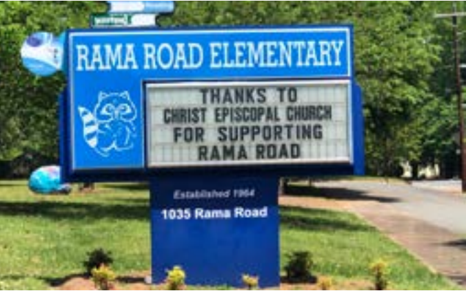
Thank you Rama Road volunteers and Girl Scout leaders for another wonderful school year! Have a great summer. See you in September!