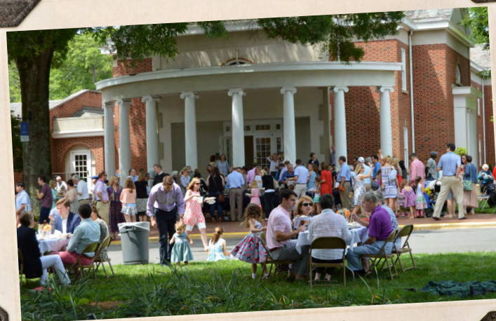
Spring Parish Day (Page 7)