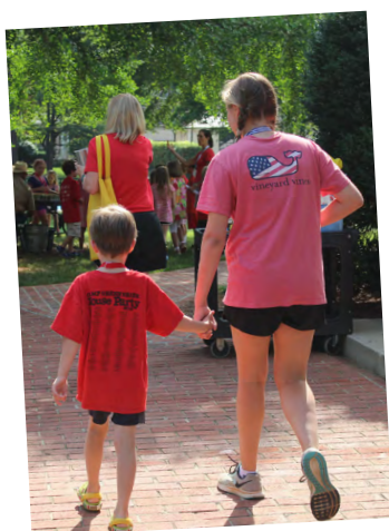
Teen Helpers are a vital part of VBS. We couldn't do it without them!!