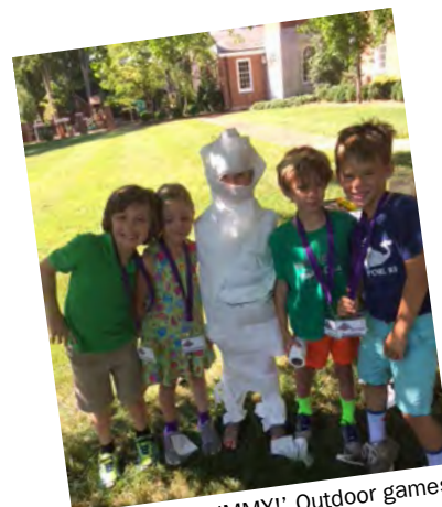
'I want my MUMMY!' Outdoor games brought us lots of themed fun.