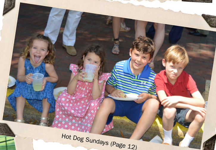
Hot Dog Sundays (Page 12)