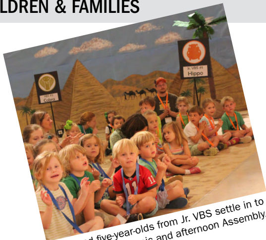
Four- and five-year-olds from Jr. VBS settle in to our 'desert' for music and afternoon Assembly.