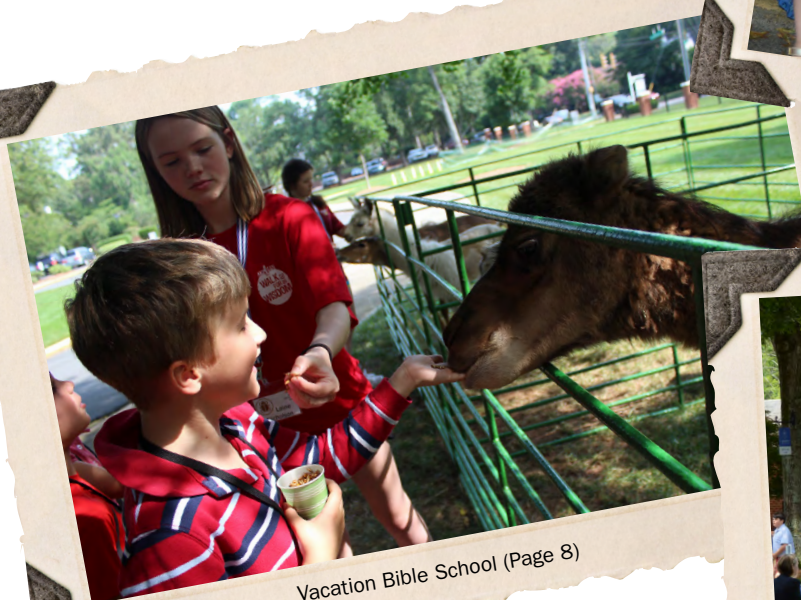
Vacation Bible School (Page 8)