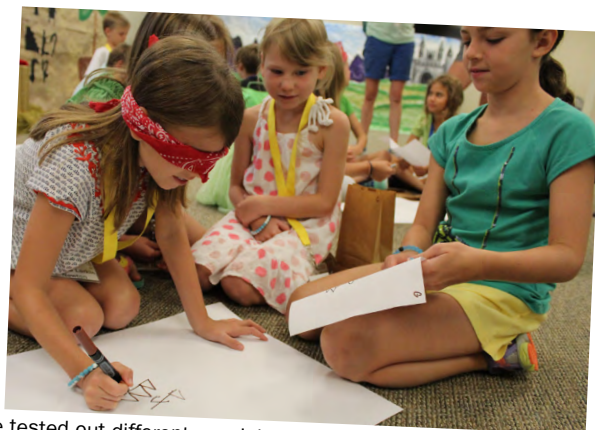
We tested out different special abilities in a concrete way to help us understand the many gifts that God gives to us.