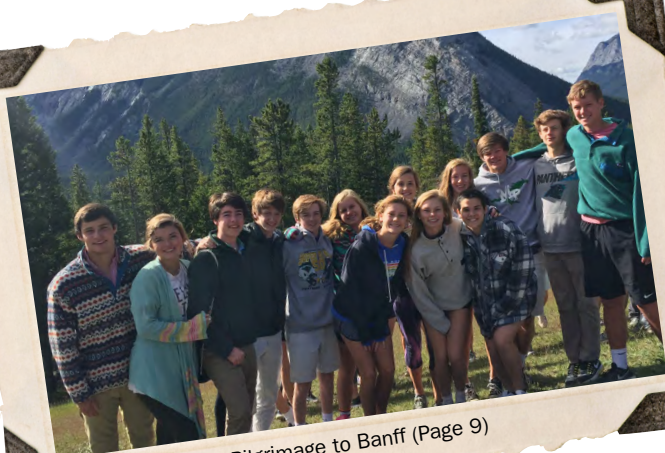
Pilgrimage to Banff (Page 9)