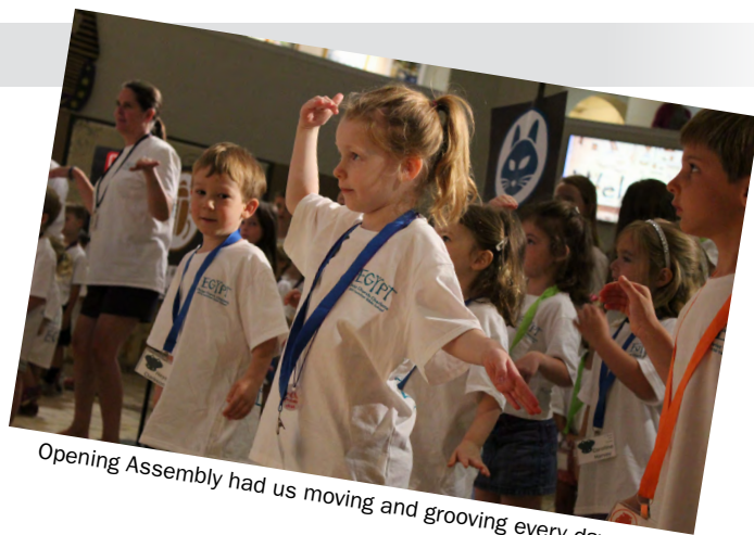
Opening Assembly had us moving and grooving every day.