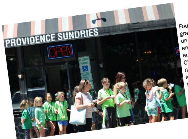
Fourth and fifth graders have a unique VBS experience: service projects throughout the Charlotte community. They enjoyed lunch at Sundries after their first day of hard work.