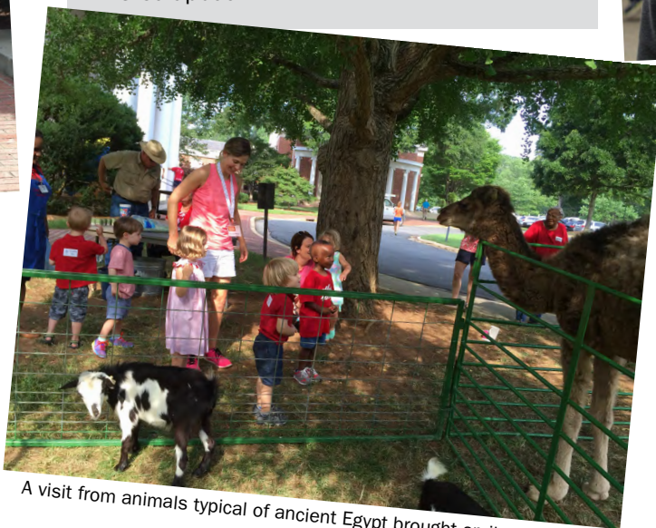
A visit from animals typical of ancient Egypt brought smiles to all.