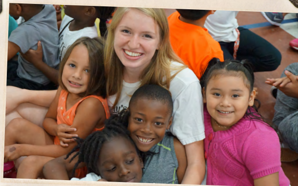
Freedom School (Page 5)